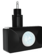
PIR Sensor Accessory FLAC3SEN

PIR plug and play sensor with remote control for setting adjustment.