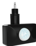
PIR Sensor Accessory FLAC3SEN

PIR plug and play sensor with remote control for setting adjustment.